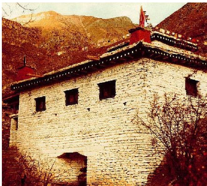
The "Temple Of Miraculous Fire" at Muktinath, Nepal. Photo by Ken Street (Nov. 1979).

[For more on this subject, please read our tract The Temple Of Miraculous Fire .]