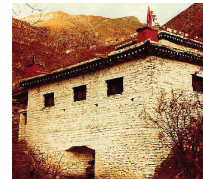
The "Temple Of Miraculous Fire" at Muktinath, Nepal. Photo by Ken Street (November 1979).

[For more on this subject, please read our tract The Temple Of Miraculous Fire. ]